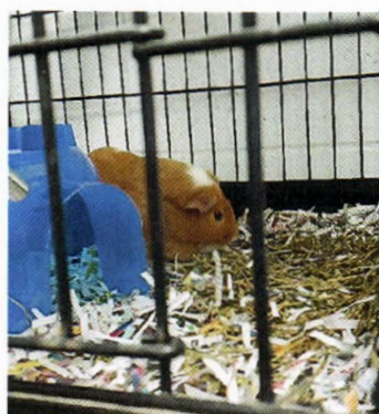
Note the exposed wall, behind the kennel