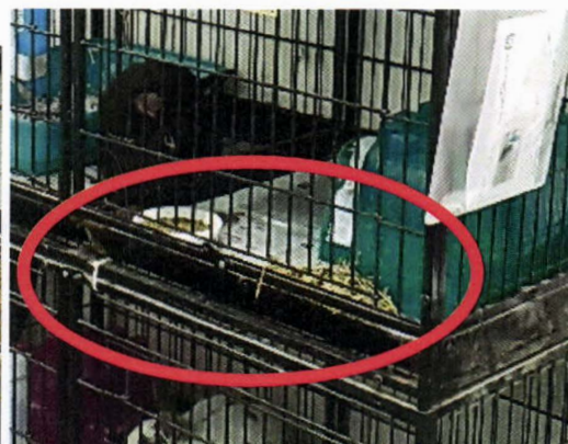
Note the "pan" under the animal, making it difficult to clean.