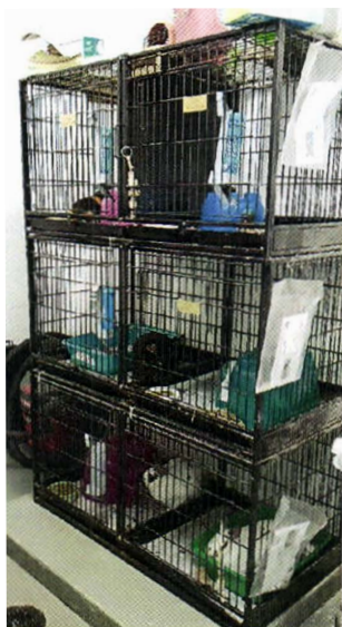
Note the supplies stored on top of the kennels

With a donation PCAPS could similarly remodel our small animal housing. Currently our rabbits, guinea pigs, and other small animals are housed in a matrix of wire cages that were put together many years ago. This bank of cages is troublesome for disease control and cleaning. The appeal of the kennels to adopters is minimal as the animals are housed behind bars. In addition, the current setup affords us no place for storage. As you can see in the photos, our supplies are often stored on top of the enclosure and must be placed there gently, as to not cause fear for the animals. There are metal pans, under the animals and their bedding that are cold, difficult to clean, trap urine and feces and become a hazard for disease control. In addition, the wall behind the enclosure is exposed, and can only be cleaned if the heavy enclosure is removed.